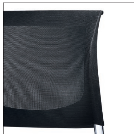
BACKREST WOVEN MESH COVERING